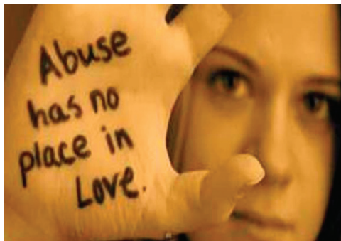
Family & Community Services Someplace Safe

Family Support Counseling; Senior Support Pediatric Rehabilitative Services Specialized Daycare- Kids Garden Solace Center Someplace Safe Veteran's Haven Radio Reading Health Services for Soldiers & Veterans Mental & Physical Health Services Sliding Scale Program Healthy Lifestyles Audiology; Community Center for the Deaf