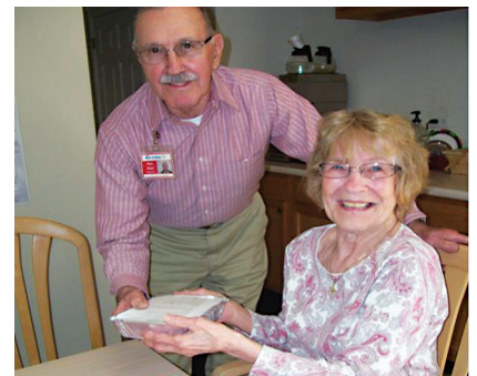
Trumbull Mobile Meals Sliding Scale Program