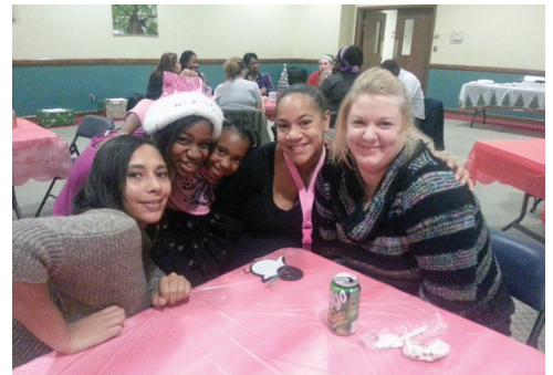
YWCA Permanent Supportive Housing