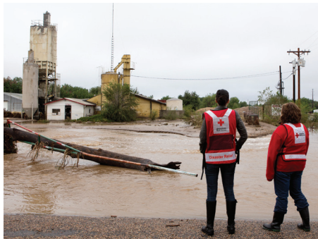
American Red Cross Emergency Assistance & Disaster Preparedness