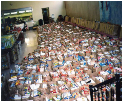
Niles Community Services Food Distribution

Individual Assistance Emergency Assistance; Nurse Assistant Training Education & Employment Services; Christy House Basic Human Needs Permanent Supportive Housing; School Age Childcare